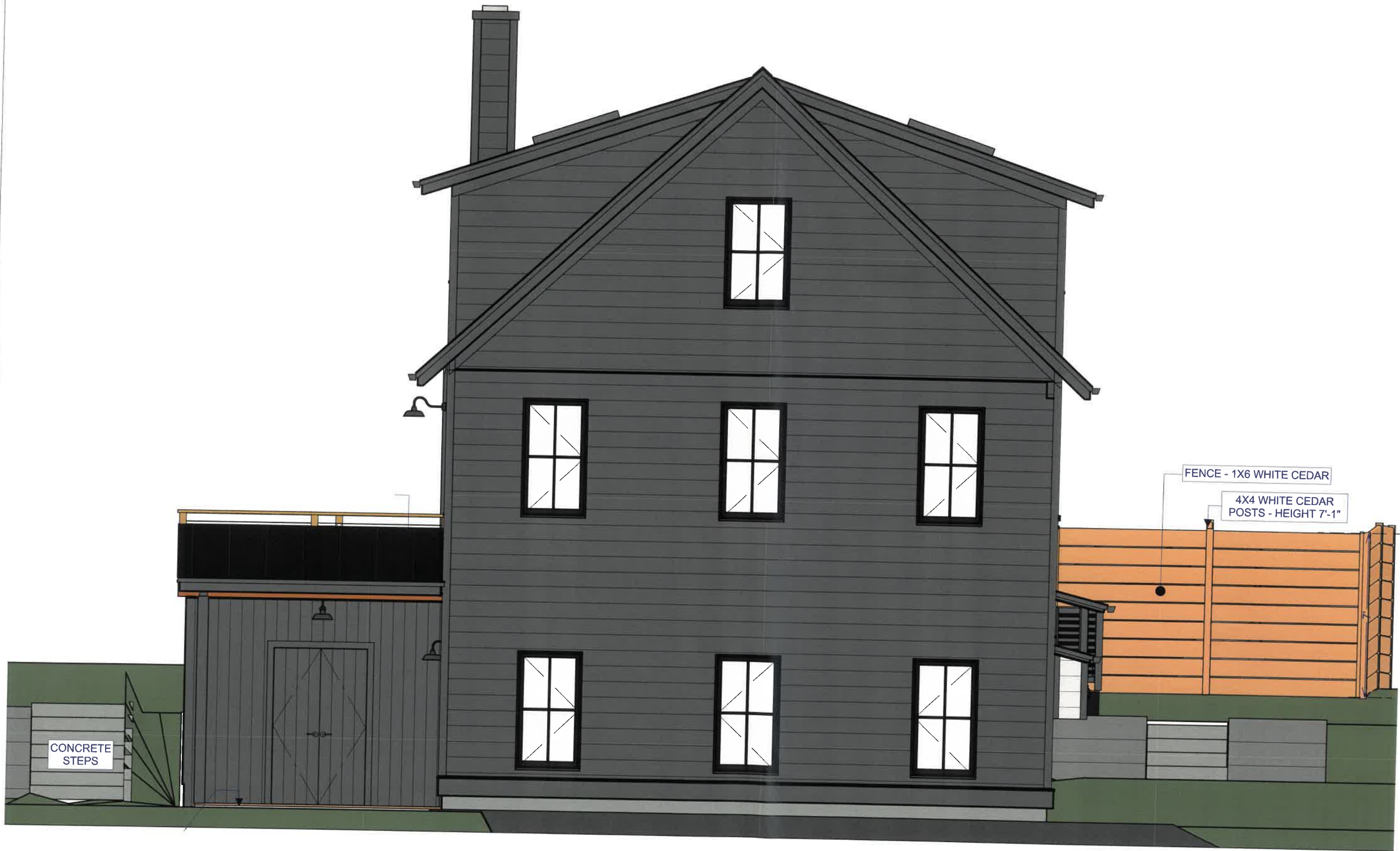
FRONT ELEVATION (REVISED) SCALE - 1/4" = 1'-0"