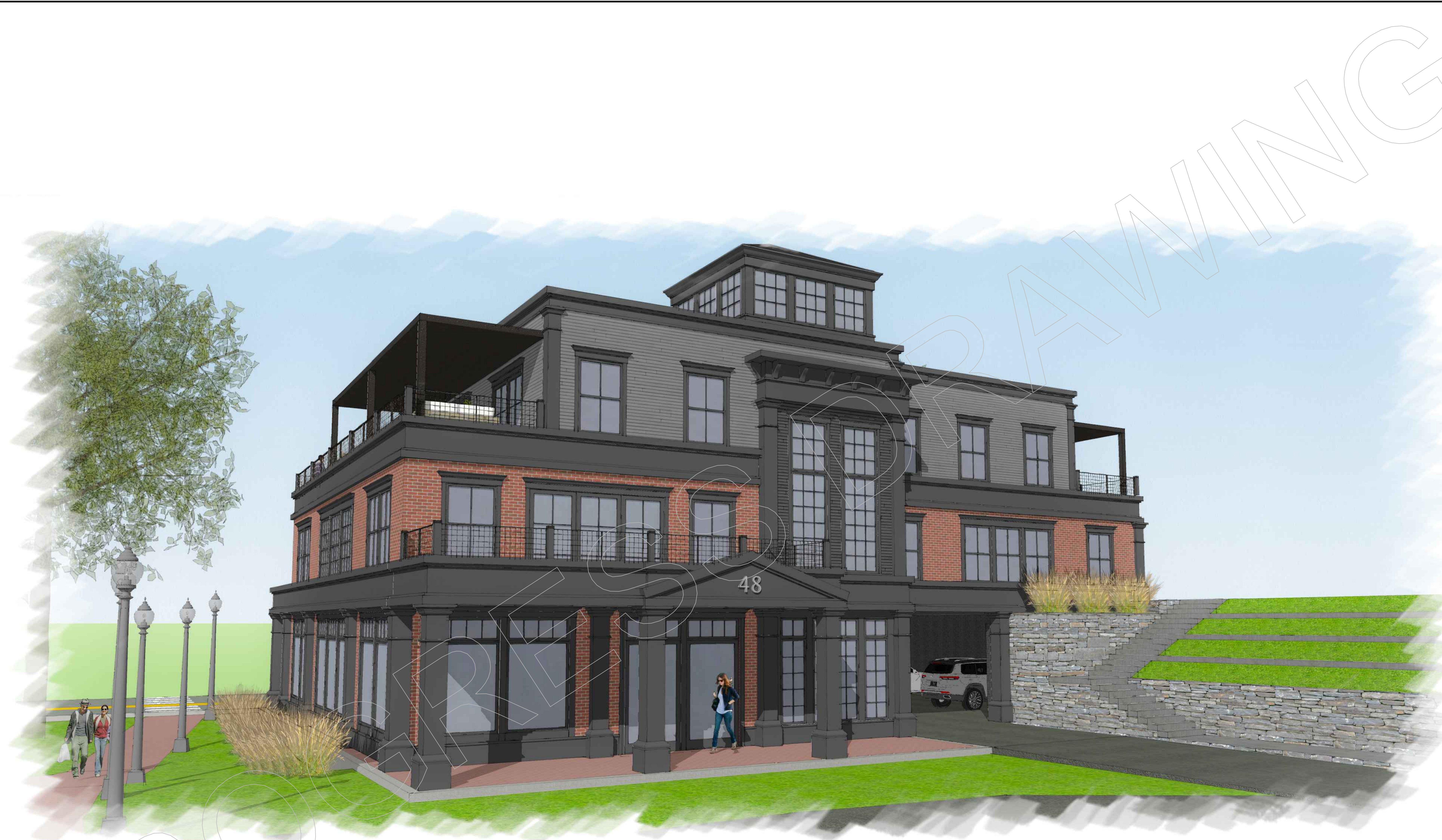
PROPOSED EXTERIOR RENDERING FROM NORTHEAST

THESE DRAWINGS HAVE BEEN DEVELOPED BY VOLANSKY STUDIO ARCHITECTURE & PLANNING FOR THE TITLED SET ONLY. THE DRAWINGS ARE THE SOLE PROPERTY OF VOLANSKY STUDIO AND THEY SHALL NOT BE USED, LENT, COPIED OR ALTERED WITHOUT THE WRITTEN CONSENT OF VOLANSKY STUDIO