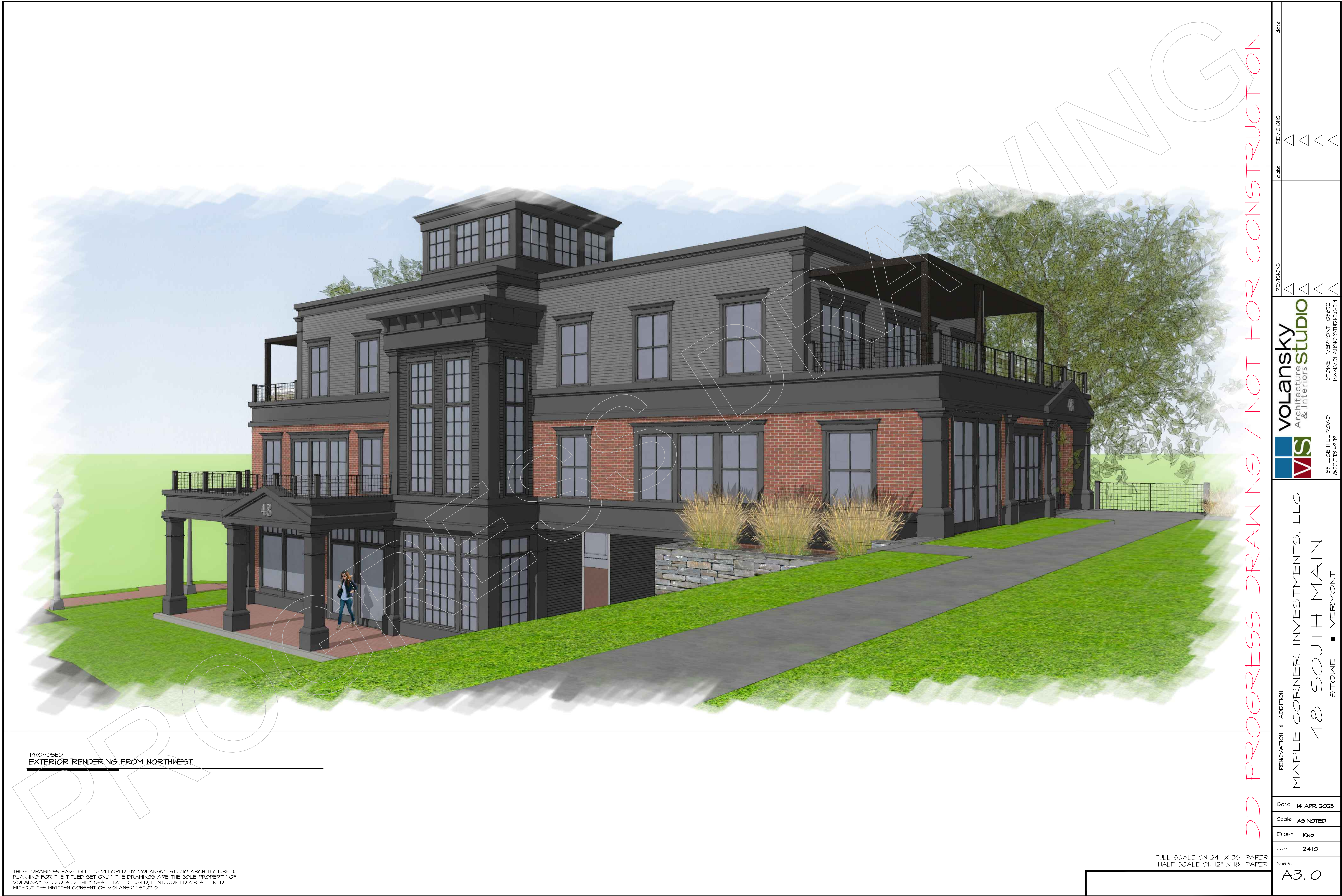
PROPOSED EXTERIOR RENDERING FROM NORTHWEST

THESE DRAWINGS HAVE BEEN DEVELOPED BY VOLANSKY STUDIO ARCHITECTURE & PLANNING FOR THE TITLED SET ONLY. THE DRAWINGS ARE THE SOLE PROPERTY OF VOLANSKY STUDIO AND THEY SHALL NOT BE USED, LENT, COPIED OR ALTERED WITHOUT THE WRITTEN CONSENT OF VOLANSKY STUDIO