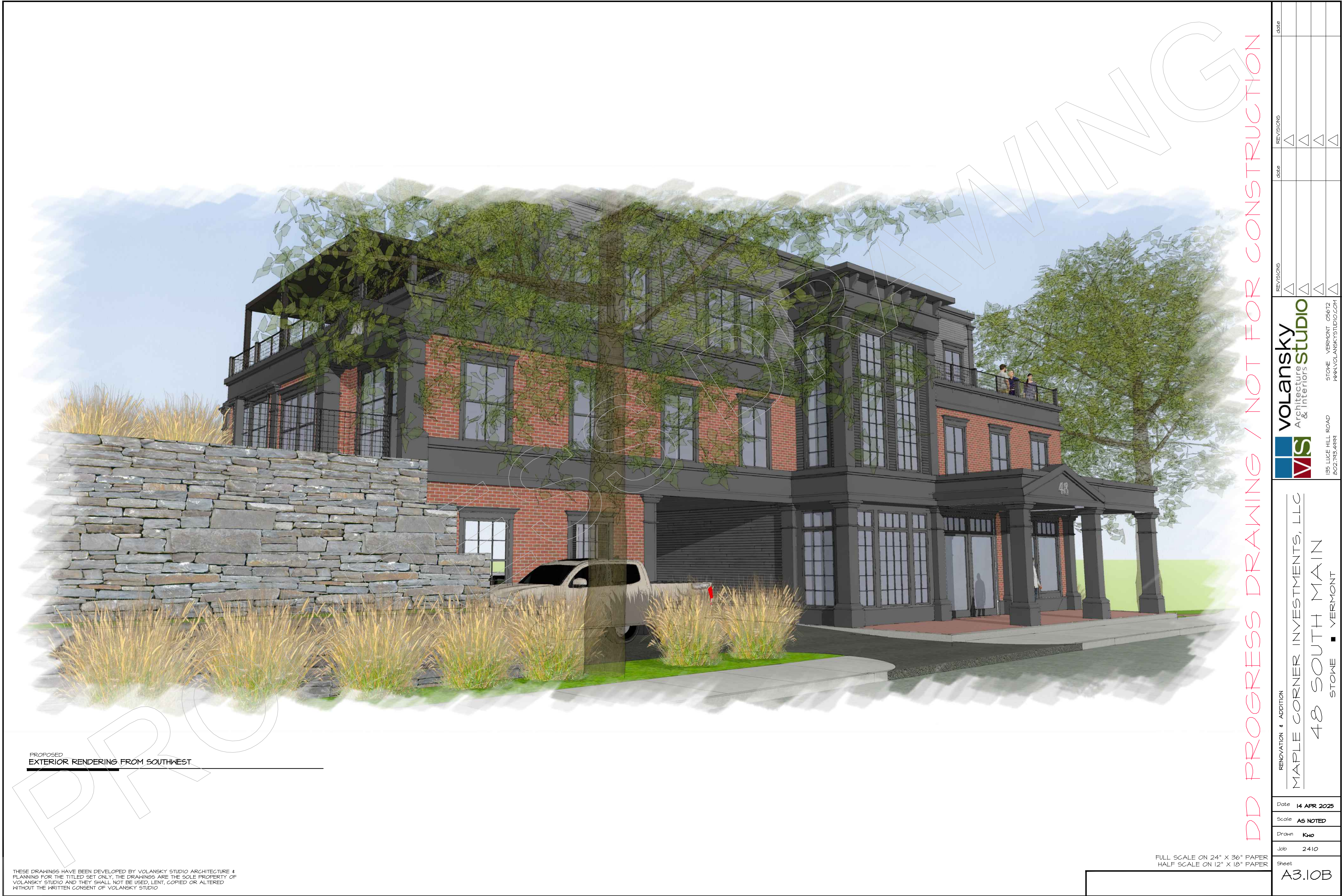
PROPOSED EXTERIOR RENDERING FROM SOUTHWEST

THESE DRAWINGS HAVE BEEN DEVELOPED BY VOLANSKY STUDIO ARCHITECTURE & PLANNING FOR THE TITLED SET ONLY. THE DRAWINGS ARE THE SOLE PROPERTY OF VOLANSKY STUDIO AND THEY SHALL NOT BE USED, LENT, COPIED OR ALTERED WITHOUT THE WRITTEN CONSENT OF VOLANSKY STUDIO