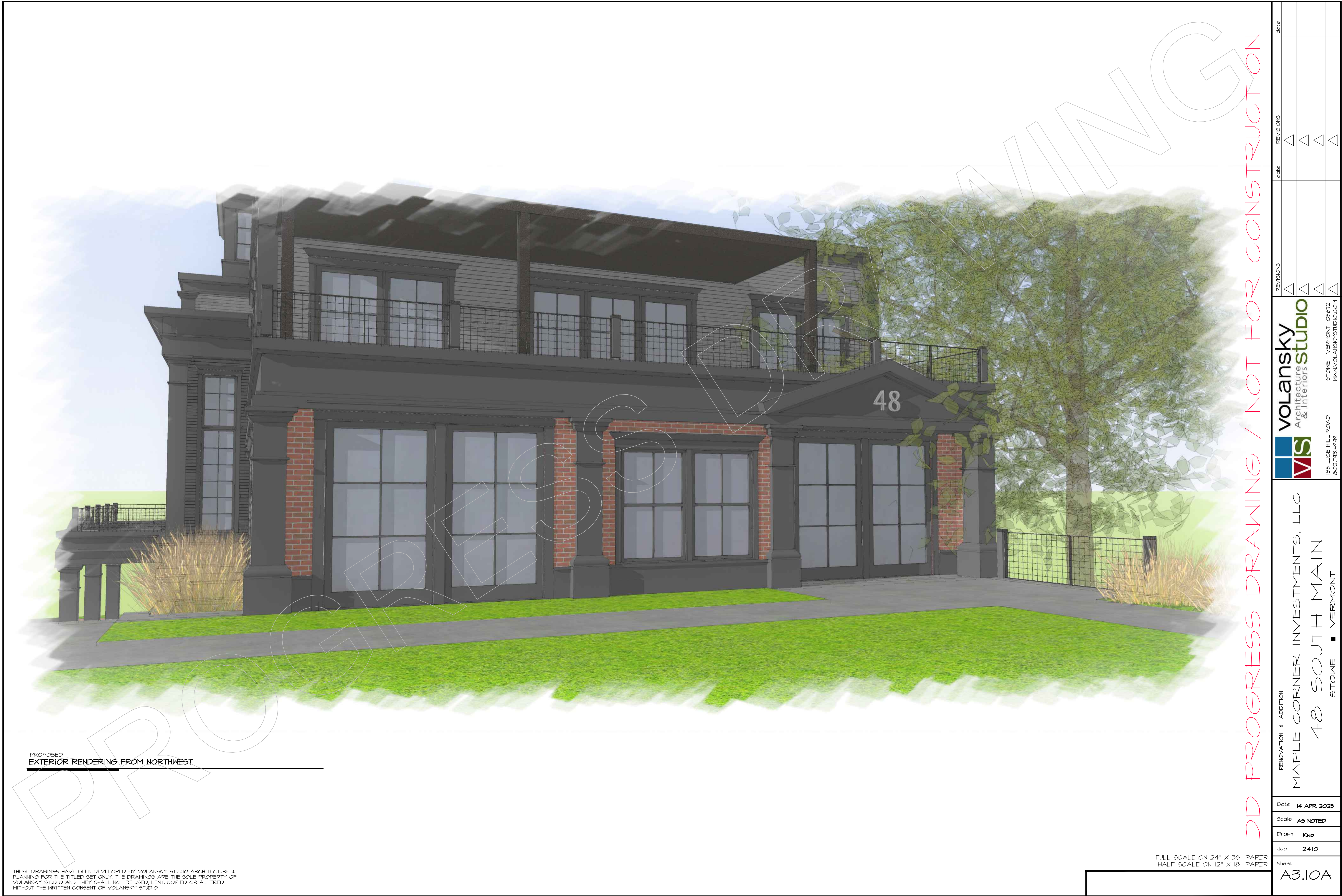
PROPOSED EXTERIOR RENDERING FROM NORTHWEST

THESE DRAWINGS HAVE BEEN DEVELOPED BY VOLANSKY STUDIO ARCHITECTURE & PLANNING FOR THE TITLED SET ONLY. THE DRAWINGS ARE THE SOLE PROPERTY OF VOLANSKY STUDIO AND THEY SHALL NOT BE USED, LENT, COPIED OR ALTERED WITHOUT THE WRITTEN CONSENT OF VOLANSKY STUDIO